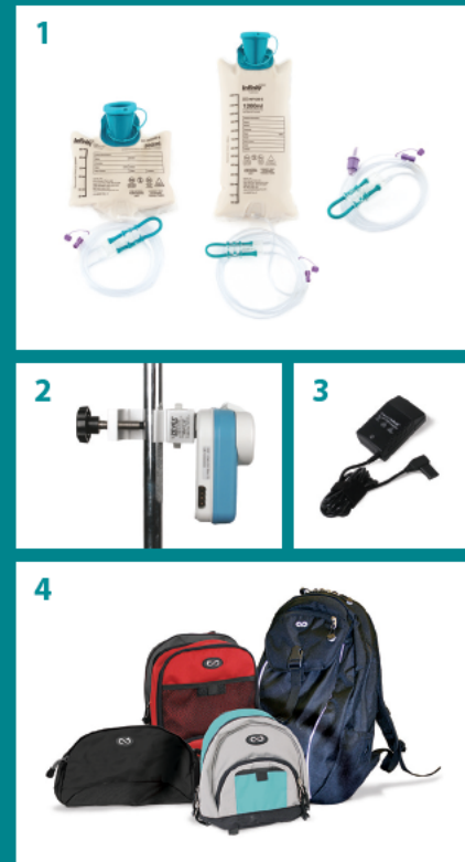
1) Infinity delivery sets, 2) Multi-Position Pole Clamp, 3) Compact Wall Charger, 4) Carry packs

Note: Infinity Orange Delivery Sets cannot be used with the Infinity Enteral Feeding Pump